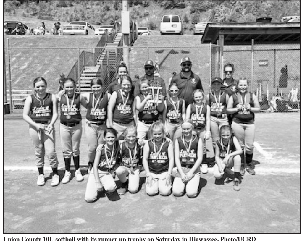
Union County 10U softball with its runner-up trophy on Saturday in Hiawassee.

Elsewhere, Union's 10U and 12U baseball teams participated in their respective Mountain Athletic Confer-